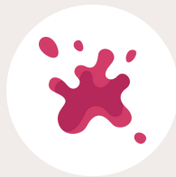
Red or purple spots on the skin