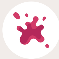
Red or purple spots on the skin